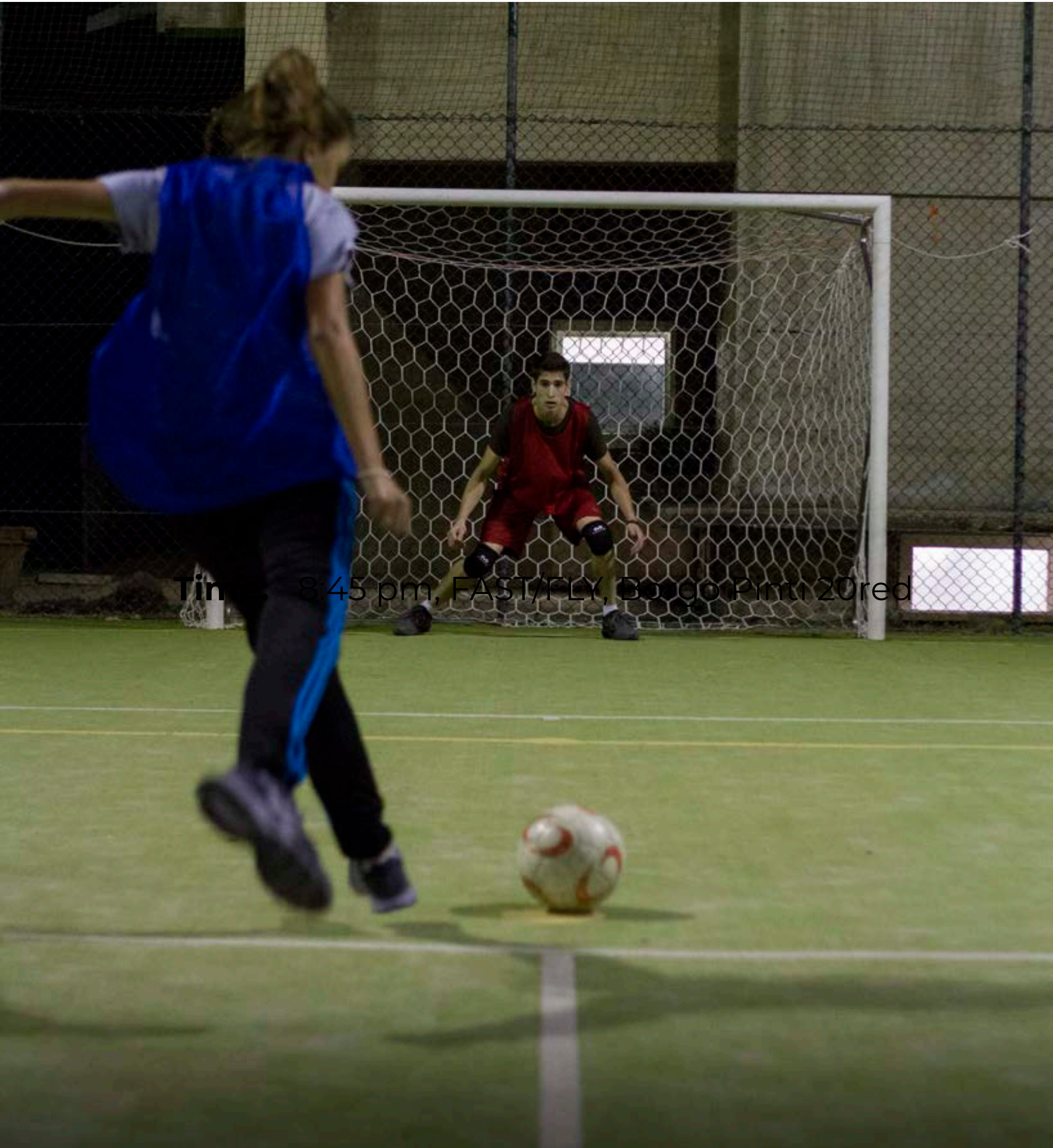
Time: 8:45 pm, FAST/FLY, Bongo Pim, 20red